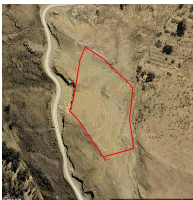
Hectares: 1.46 High Damage Planted Trees: 1,000 📍 -15.9954718, -69.8053894