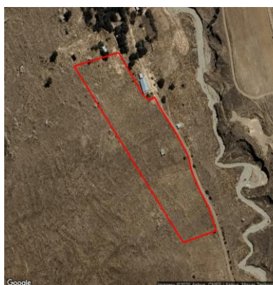
Hectares: 1.5 High Damage Planted Trees: 1,335 📍 -14.8429567, -70.5883106