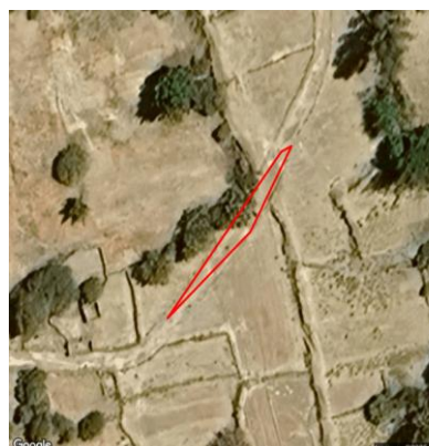
Hectares: 0.01 High Damage Planted Trees: 550 📍 -16.0416241, -69.6976793