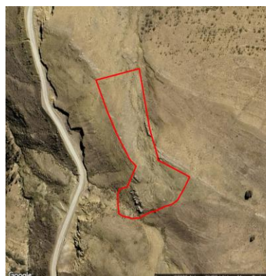
Hectares: 1 High Damage Planted Trees: 1,000 📍 -15.9970522, -69.8048620