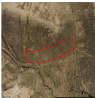
Hectares: 3.34 High Damage Planted Trees: 3,000 📍 -16.0841694, -69.7446663