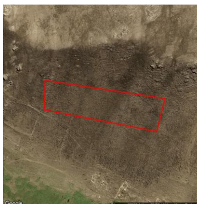
Hectares: 1.13 High Damage Planted Trees: 1,120 📍 -16.0203294, -69.8126772