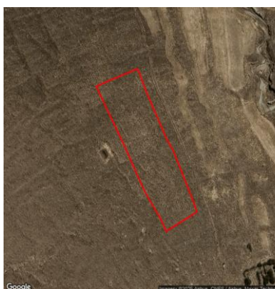
Hectares: 1.02 High Damage Planted Trees: 1,125 📍 -14.8393607, -70.5905363