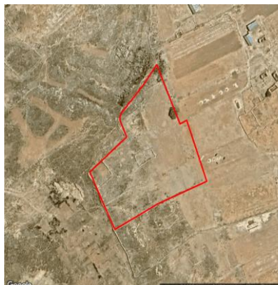
Hectares: 0.36 High Damage Planted Trees: 500 📍 -16.0177310, -69.6562324