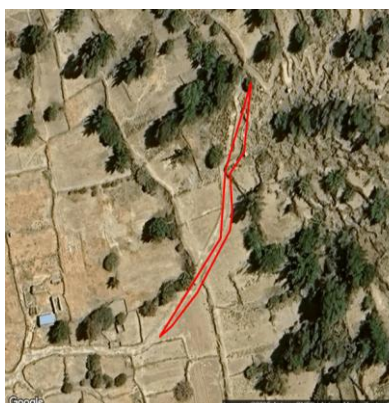
Hectares: 0.04 High Damage Planted Trees: 550 📍 -16.0413193, -69.6975427