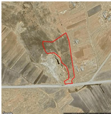
Hectares: 0.6 High Damage Planted Trees: 500 📍 -16.0192159, -69.6556488