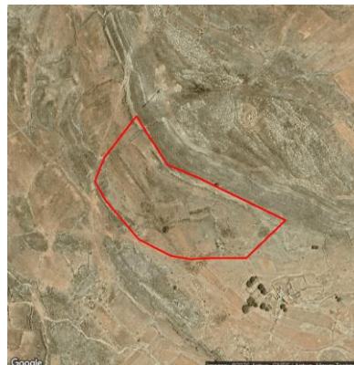
Hectares: 1.23 High Damage Planted Trees: 1,250 📍 -16.0307753, -69.6581014